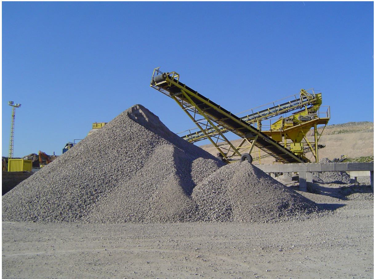
Figure1: Recycled aggregates.

The recycled aggregates (RA) from Construction and Demolition Waste (CDW) were supplied by the plant owned by the company TEC REC, located in Madrid (Figure 1). These aggregates present the granulometry required for unbound granular materials in fraction 0/40. Their approximate composition in weight is as follows: Concrete (72%); Stone (20%); Ceramic (3%); Plaster and other impurities (1%) and Bituminous materials (4%). The flakiness index and sand equivalent values meet the requirements stipulated in the Spanish specifications PG-3 (Dirección General de Carreteras, 2002a). The Los Angeles fragmentation coefficient is 30%. This value does not meet the requirements for heavy traffic laid down in PG-3 for heavy traffic flows T00 and T0 on base courses (Dirección General de Carreteras, 2002b). Moreover, the absorption coefficient of RA (coarse) is 4.86%, which is a much higher value than those presented by the NA.